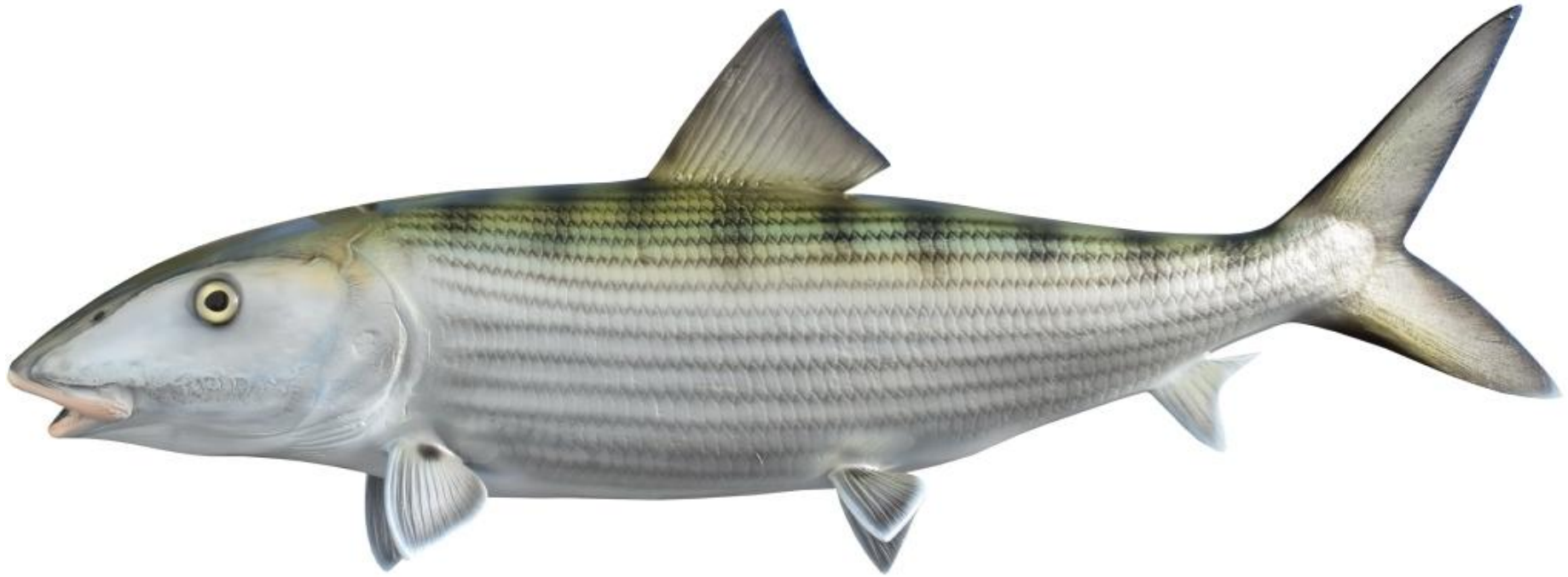
Bonefish ( Albula vulpes )